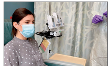
Figure 2. Patient Wearing a Mask.

The clinician is shown wearing the PPE required during collection of a nasopharyngeal swab specimen.