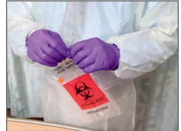
Figure 4. Handling the Nasopharyngeal Swab Specimen.

Shown is the swab in a collection tube placed in a biohazard bag.